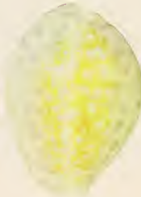
Figure 3 b